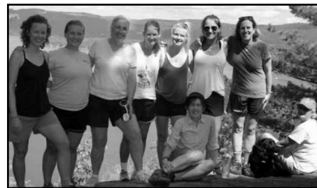
Conolly Celebration Weekend: A festive send off. Saturday hike up Sugarloaf.