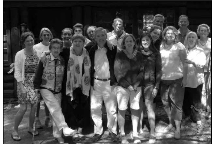
Onaway Trustees at the August 2015 Meeting.

has ties to Onaway, Mowglis and Pasquaney. She was a camper, OWLE, aide and counselor at Onaway between 1999 - 2011. She graduated from the University of St. Andrews in Scotland in 2012 and is currently residing in New Hampshire and working for the Political Committee of New Hampshire Governor Maggie Hassan, where she is Deputy Finance Director and Call Time Manager.