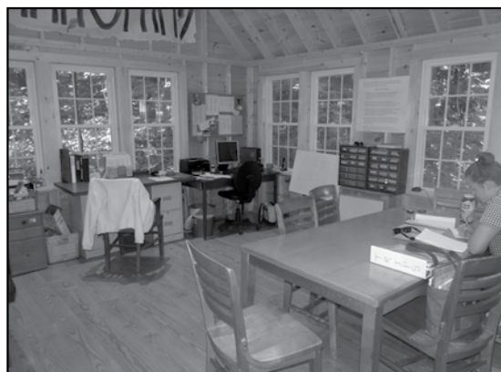
Inside the office.