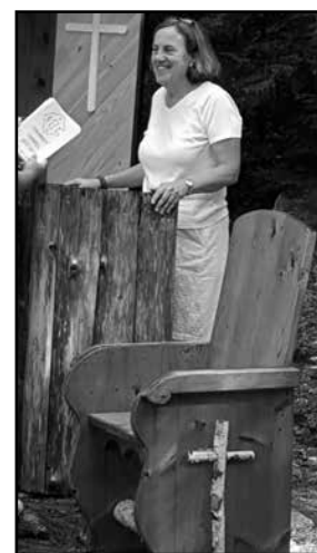
New Chapel Chair